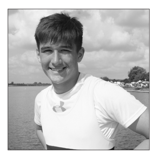
CHRISTCHURCH Junior Boys Under 16 Single Sculls

RYDE Junior Boys Under 16 Coastal Single Sculls